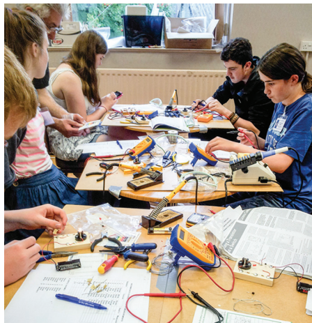
Some of YOTA UK delegates building and testing their DC circuits.

with the general feeling of the weekend; she said, "I think it's a credit to RSGB to have these young people involved. I really enjoyed the practical sessions. I thought they went particularly well because of the level of peer-to-peer learning, which I think a lot of the participants enjoyed as well. I think it is a really good way of showing the diversity of the ways to be involved in radio. It would be good to try to make accommodation on site or very near, and some sort of activity for the evening."